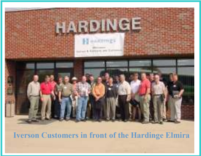
Iverson Customers in front of the Hardinge Elmira

On May 10, 2005 a group of Iverson & Company customers traveled to Hardinge to see first hand one of the world's premier machine Tool builders. Many of these customers had comments to share once the visit had been complete: