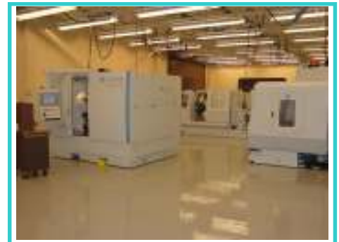
Hardinge LMC 42 and TT65 machines shown above give you full multi function capabilities!

latest technological advancement from Hardinge. Call your Iverson & Company salesman for details.