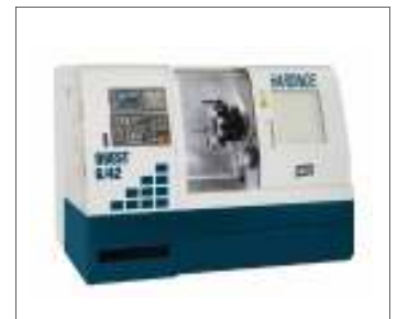
Hardinge Quest 6/42 CNC Lathe

This machine will also feature live tooling and C axis contouring. This will give instructors the ability to mill shapes and even engrave on the outside diameter of a turned component. These capabilities are commonly featured on a 4th axis vertical machining center, rather than a CNC lathe.